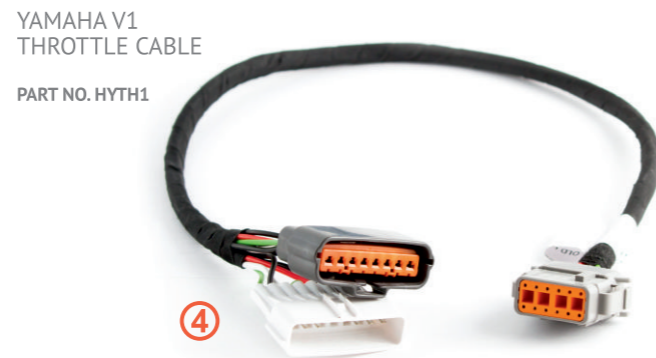
YAMAHA V1 THROTTLE CABLE PART NO. HYTH1