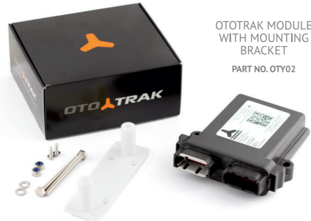
OTOTRAK MODULE WITH MOUNTING BRACKET PART NO. OTY02